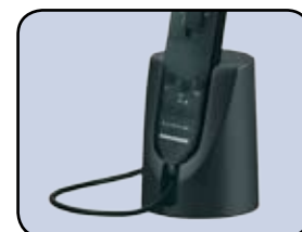
With adjustable tension of slide switch... ... and microphone stand