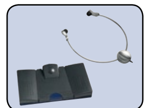
Compatible with existing foot control and headsets from Grundig Business Systems